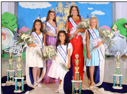
2011-12 Texas State Royalty