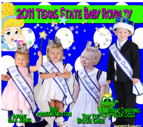
2011-12 Texas Baby Royalty